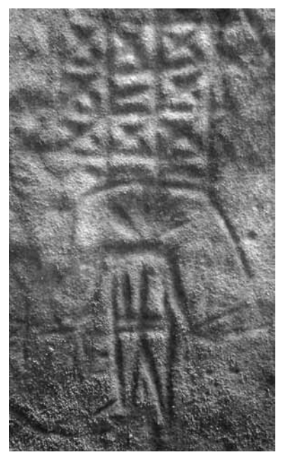
Fig. 5 Lady with box-like headgear