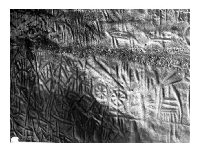
Fig. 7 Animals in a move towards the anthropomorphic figures and wheel symbols