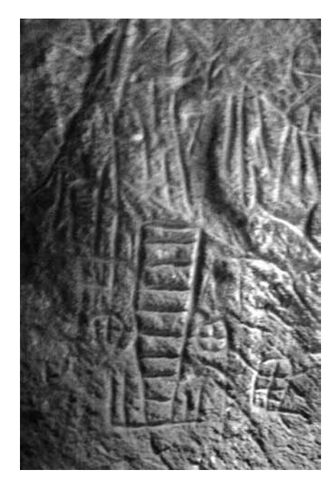
Fig. 6 Ladder design with an anthropomorphic figure above and two circles with cross in it