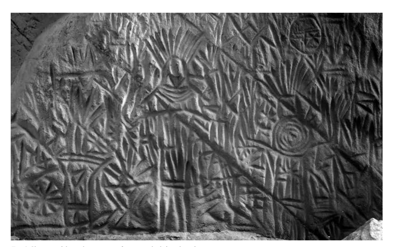
Fig. 3 Close-up of the anthropomorpic figures on the left rock surface