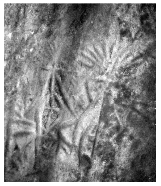
Figs. 4a and 4b Female forms in the shelter