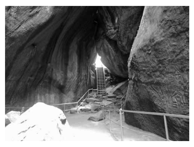
Fig. 1 Edakkal rock shelter general view from inside

Thurston, Edgar. 1909. Castes and Tribes of Southern India. Delhi (Asian Educational Service) (2001 reprint)