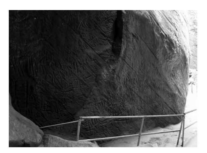
Fig. 2 Petroglyphs on the left rock surface of the shelter